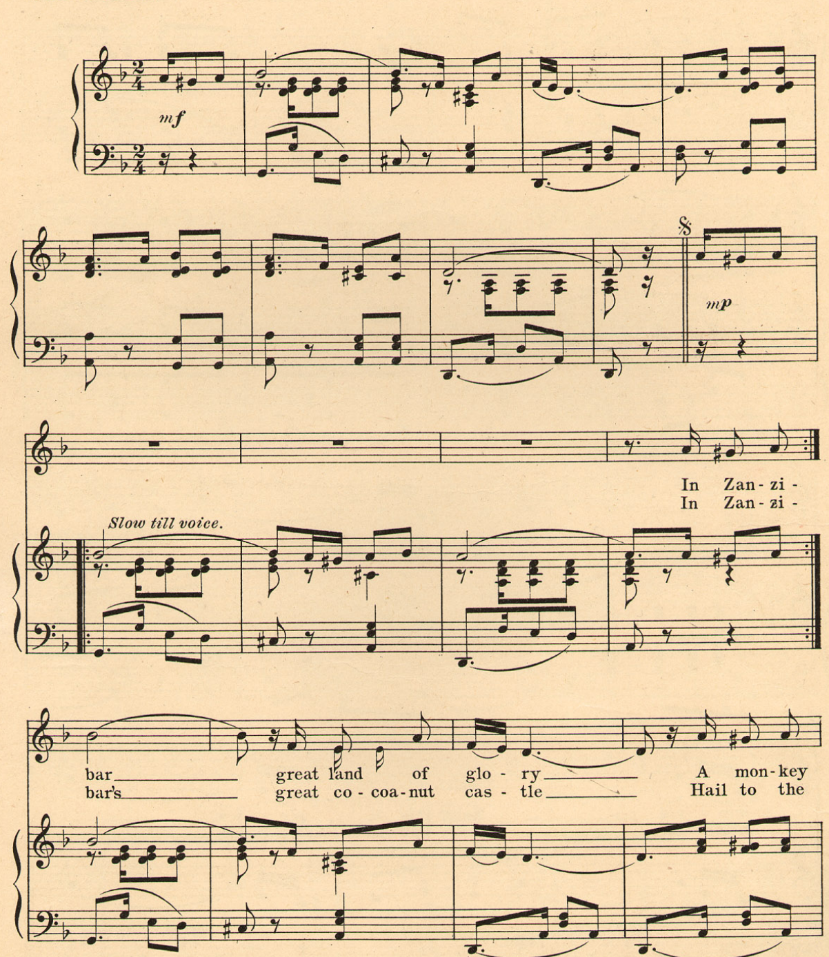
International Copyright Secured.