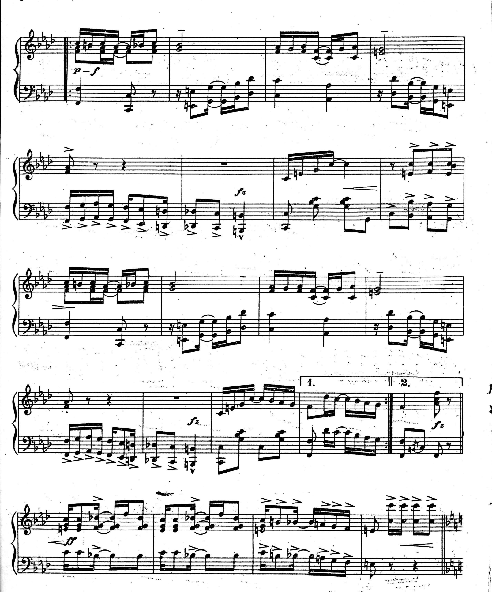
That left-hand rag 4.