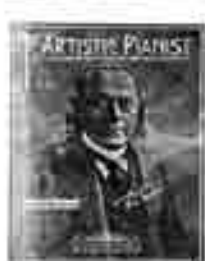
VLADIMIR DE PACHMANN