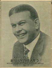
FEATURED BY BILLY BEARD WITH KING, FLEISS & HINSTRELS